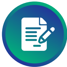
Private Power Purchase Agreements (PPA) and Contractor for Solar technology