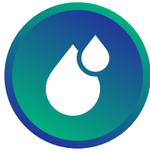
Oil & Gas equipment trader

At GMS Services, we're your go-to for energy transition. We trade in oil and gas equipment, solar equipment, and renewable energy certificates. Plus, we secure PPA and contracting opportunities through partnerships. From traditional fuels to modern renewables, we're committed to sustainability. GMS Services leads the way in providing quality, reliability, and environmentally responsible solutions for a cleaner energy world.